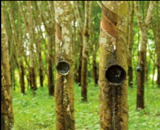
Monoculture: To date most of the raw material for rubber production has been provided by the rubber tree. In the future, dandelions will provide an alternative to traditional sources.

Dr. Topp: One vital factor for the success of this project is a full grasp of everything from cultivation of the crop to obtaining latex from the dandelion roots. That's not to say, of course, that