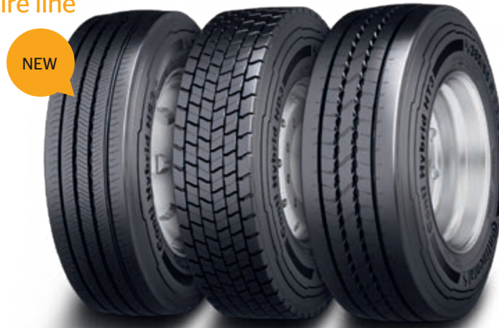
Conti Hybrid HS3+ Conti Hybrid HD3 Conti Hybrid HT3 3