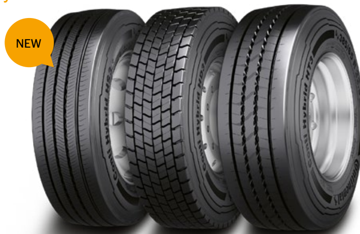
Conti Hybrid HS3+ Conti Hybrid HD3 Conti Hybrid HT3 3