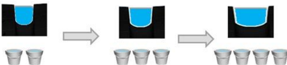
Schematic presentation of stereotypes – in reality the void of the grooves only vary slightly

The higher the void volume the more water can be dispersed and the better is the aquaplaning performance.